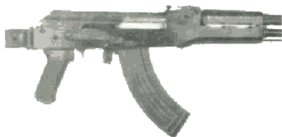
Fig. 2 The Safety Lever in the "FIRE" position.