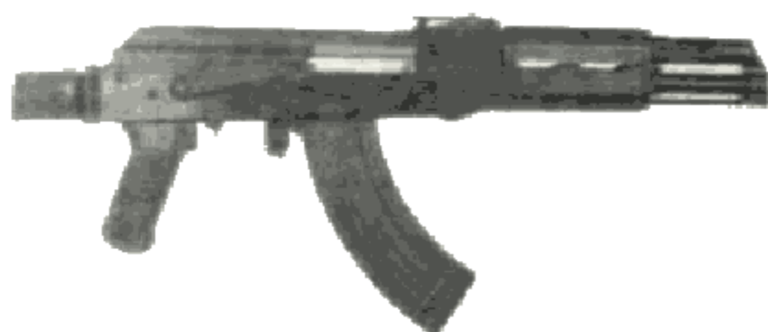
Fig. 1 The Safety Lever in the "SAFE" position.

Unlike most safeties, the safety on the AKS-762 SP has been positioned where it cannot be easily operated by right-handed shooters without first removing the index finger from the trigger. IT IS STRONGLY RECOMMENDED THAT ALL SHOOTERS, LEFT - OR RIGHT-HANDED, KEEP THEIR FINGERS AWAY FROM THE TRIGGER GUARD WHEN OPERATING THE SAFETY IN ORDER TO AVOID THE POSSIBILITY OF ACCIDENTAL DISCHARGE.